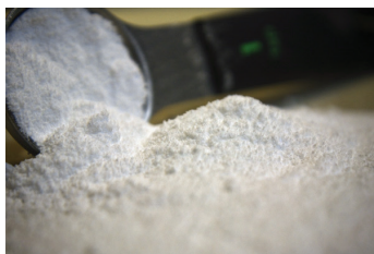
6. Borax (1 tablespoon)