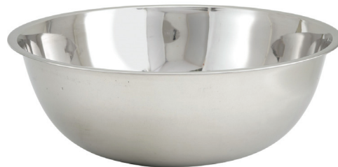
3. 1 x Mixing Bowl (A) About 1 litre or bigger