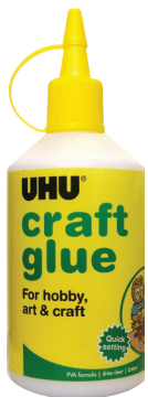
1. UHU Craft Glue 250ml