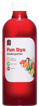
4. Food Dye